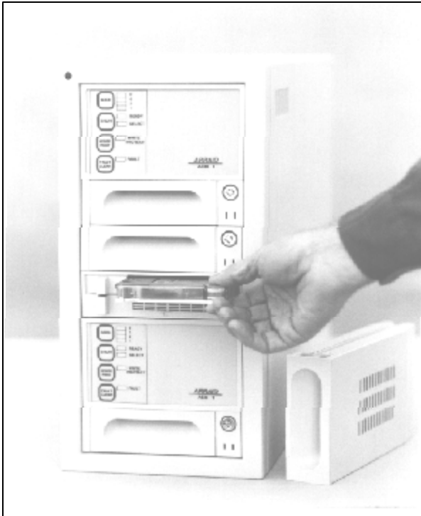
Dual AEM-3 Table Top unit with Removable Drives, Disk to Disk Copy, and Tape Backup options.

The AEM-3 uses a combination of microprocessor control and Field Programmable Gate Array logic for optimum performance and flexibility. As a result, configuration changes and field upgrades can easily be implemented as software/firmware changes.